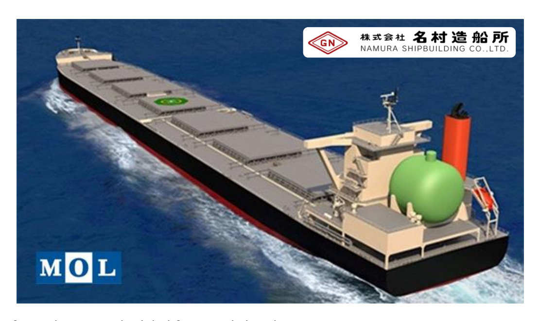
CG of a coal carrier scheduled for actual ship demonstration

A portion of the methane in LNG fuel is exhausted into the atmosphere as unburned methane. Methane has a higher greenhouse effect than CO_2 , and methane slip reduction is required from the perspective of greenhouse gas reduction.