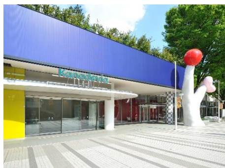
Exterior of the Hall (image)

Period : April 1, 2025 - March 31, 2028 (3 years)