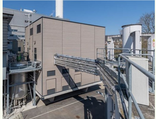
Limeco plant, Dietikon, Switzerland

HZI Schmack GmbH has completed an industrial PtG plant at a waste to energy and wastewater treatment complex owned by Swiss utility Regiowerk Limeco (Dietikon, Canton of Zurich). The PtG plant produces high purity methane gas from hydrogen and CO 2 in a biological reaction and the produced methane gas is fed into gas grid.