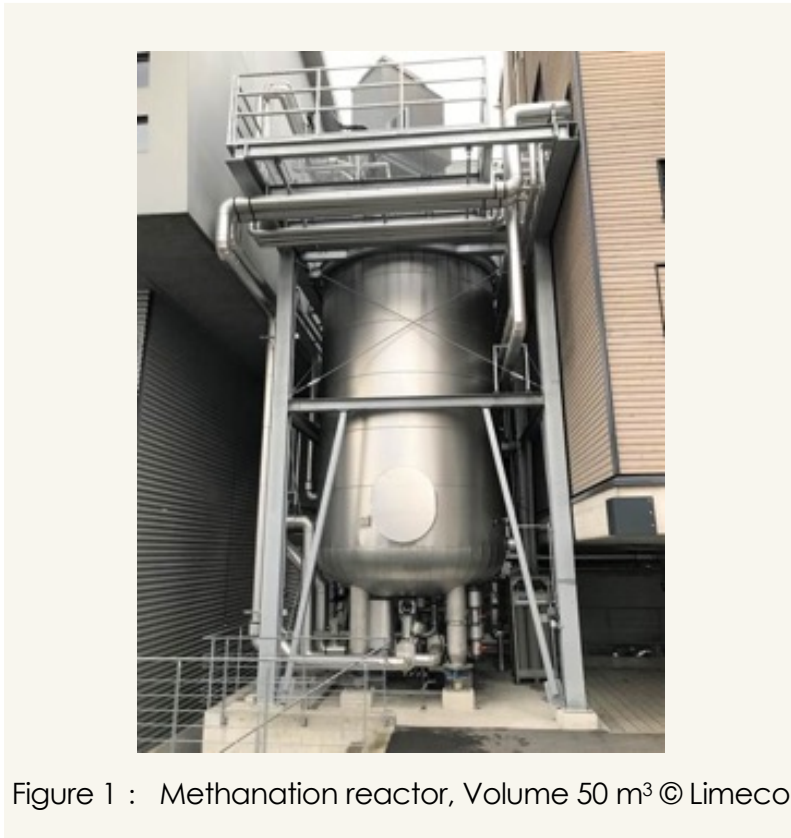
Figure 1 : Methanation reactor, Volume 50 m 3